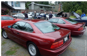
Wuffer's Garage & Spa: Fifteen (15) cars in attendance!