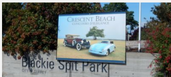
Signage on location in Surrey, BC.