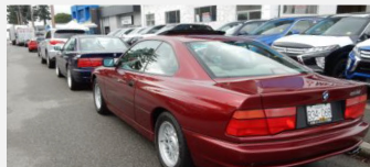
Some 8's at the event.