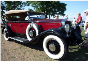
Best of Show - 1931 Pierce Arrow 8 Dual Windscreen Phaeton.