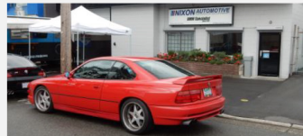
Wuffer gets upfront parking at Nixon's!