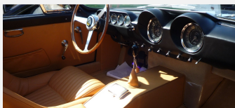
Interior - 1964 Ferrari 250 GT Berlinetta Lusso.