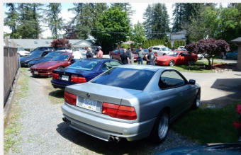
Many cars brought-in by the BC8's gang.