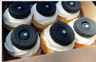
Gluten-free cupcakes with very fancy, edible decorations.