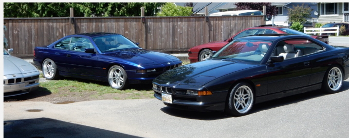
Some of the E31's brought in for the celebration at Wuffer's Garage and Spa in Langley, BC.